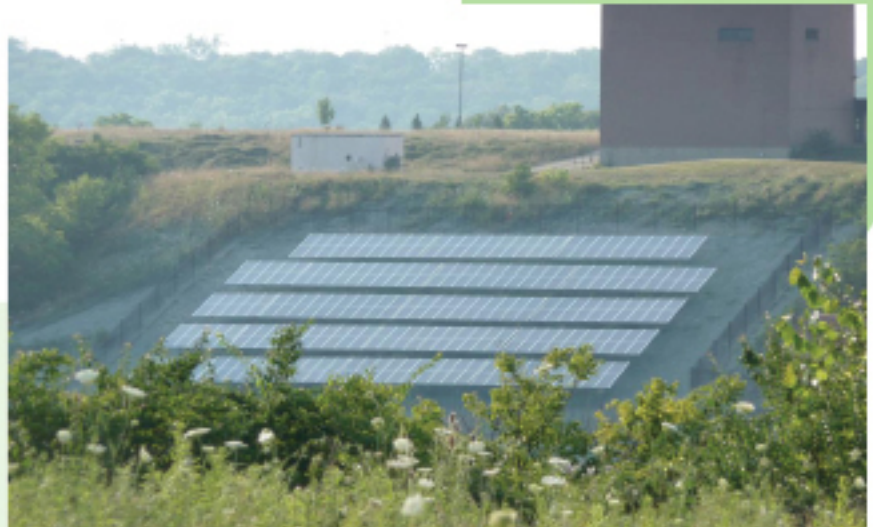
The 61 kW Mound Advanced Technology Center project, helping Ohio reach its renewable energy requirements.

In addition, we also customize the inverters and Balance of System to ensure proper performance of your installation.