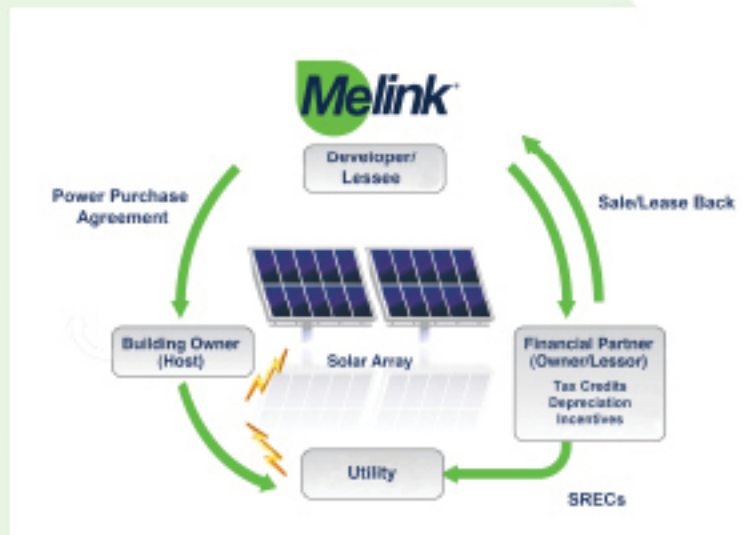
Power Purchase Agreements allow you to purchase energy without the upfront capital investment.