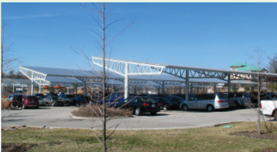
The Melink Solar Canopy at the Cincinnati Zoo is 1.6 MW and covers a 7 acre parking lot.